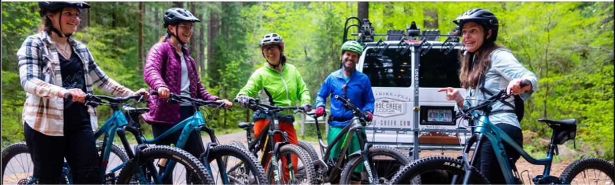
Things To Do • Trip Ideas • Favorite Trips • Why Guides Are the Best Way to Explore Oregon

Experiencing the wild, untamed Snake River in Oregon's Hells Canyon - America's deepest river gorge - is a must-do experience. Travelers can book a half-day, daylong or overnight trip with Hells Canyon Adventures through the deepest portion of the canyon, with an opportunity to see historical sites and even swim in July and August. Add another layer to the experience and try your hand at fishing for sturgeon or steelhead with a guide - if you're lucky you could land a tasty catch. Tours are offered spring through fall.