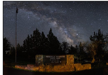
GEORGE FARIA PARK RANGER TOURS Dark sky tour guide