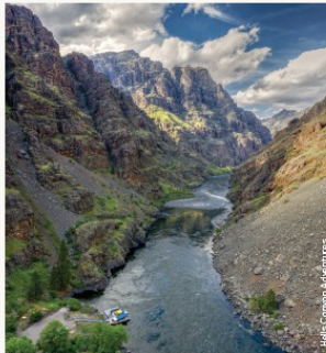
Hells Canyon Adventures

Love wine tasting, hate driving? Wine de Roads offers a unique spin on wine touring, helping travelers cycle at a leisurely pace between tasting rooms in the world-famous Willamette Valley. Groups typically stop in for a tasting at three wineries, tour the vineyards, learn about Oregon's wine culture and soak up the idyllic views between stops. Tours are offered spring through fall.