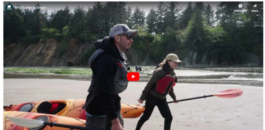
Why Guides in Oregon

May 11, 2021 (Updated February 28, 2022)