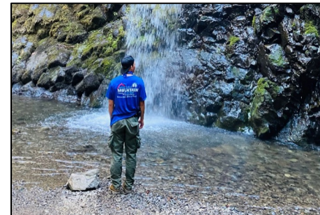
TBD ADVENTURES WITHOUT LIMITS Adaptive guides